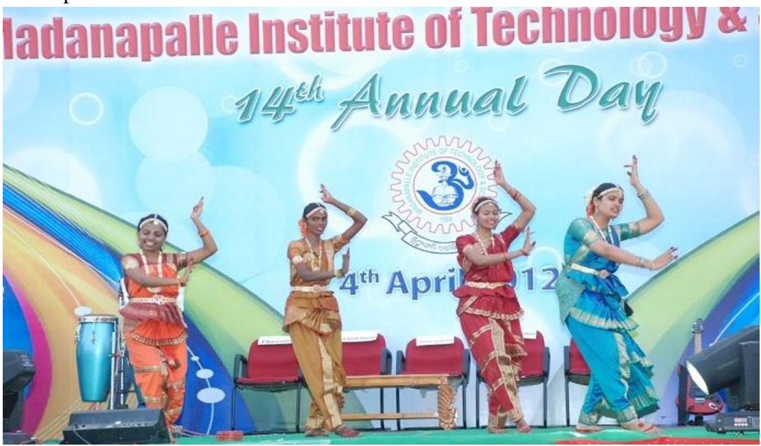
Annual Day Celebrations