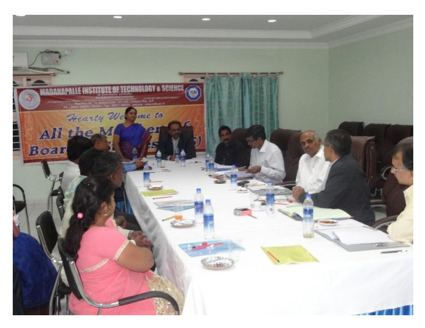
Board of Studies Meeting

On obtaining the UGC Autonomy during 2014, the institution has made a study across the country for designing the best curriculum for higher education. After approaching several entrepreneurs, parents and students of various institutes, it has concluded to implement the BITS, Pilani-Hyderabad curriculum & teaching practices for UG students and IIT-Hyderabad curriculum for PG (M. Tech.) students. Thus, signed MoUs with these institutes and 120 faculty members of MITS are trained at BITS, Pilani - Hyderabad and IIT - Hyderabad on curriculum development and innovative teaching and learning processes. Similar exercise is also made for MBA & MCA programmes.